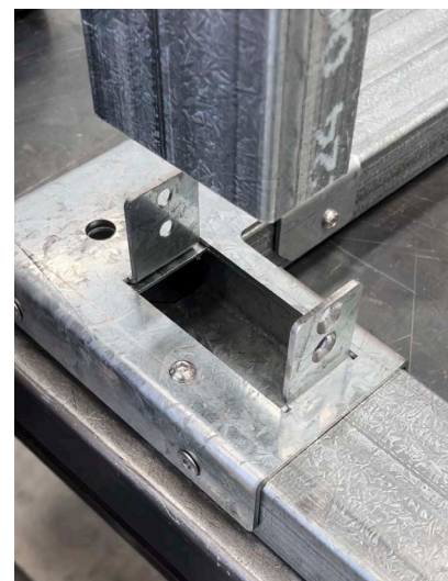
The picture shows how the corners are assembled through the 80x40 frame beam to achieve maximum stability.