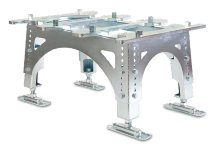
The 2.0 model for floor heights 400-610 mm (16-24 inches) are lighter and provide additional space for trays and cables run to and from cabinets