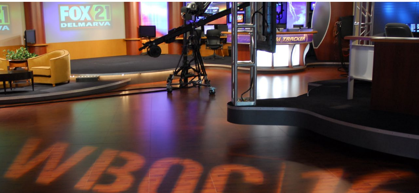
The WBOC Newsplex Studio in Salisbury, Maryland USA uses about 850m 2 of Tech Floor with Alder laminate finish.

Trust the Bergvik name for high quality and dependability!